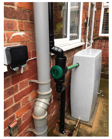
L to R: Nat Flatman Street property frontages and example rear garden smart tank installations.